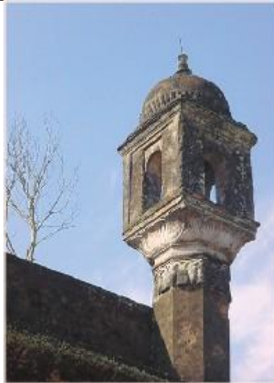
Nayabad Mosque, Dinajpur